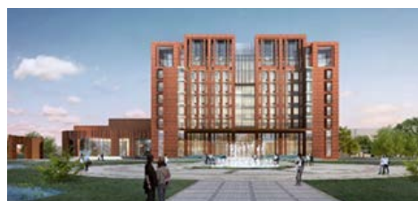
Figure 5 Iconic new complex effect